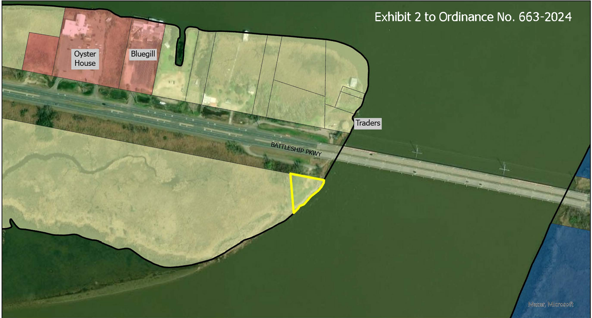
Exhibit 2 to Ordinance No. 663-2024