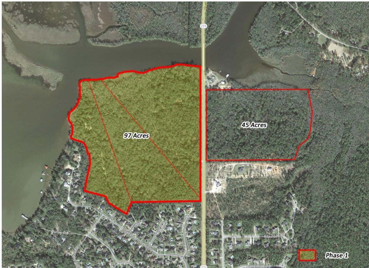
Figure 1: Aerial of approximately 100-acre parcel for master plan development.

It is our understanding that the City of Spanish Fort is requesting the planning and design related services for a passive recreation nature park on the approximately 100-acre parcel at Honor Park (See Figure 1). The master planning process will involve receiving stakeholder and community input through a public engagement process prior to developing the final conceptual master plan.